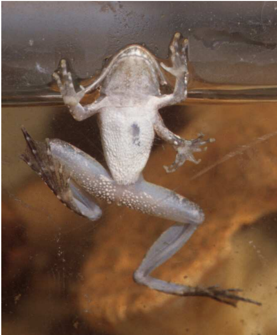
Five-legged Acris crepitans collected along Big Creek in Sam A. Baker State Park, Wayne Co., Missouri. The specimen was photographed 8 October 2000 while it was on display in the park Nature Center.

The Detroit Zoological Institute (DZI) has a long history of success with amphibians. In 1997, DZI intensified its commitment to amphibian conservation with the inception of the National Amphibian Conservation Center (NACC), the first facility in the world designed, constructed, and interpreted specifically for amphibians. Set in a 2-acre resurrected Michigan wetland, this 12,000-square-foot facility is dedicated to saving amphibians and shaping public attitude toward these threatened and valuable animals. Nearly half the facility will be off-exhibit, comprising holding and breeding rooms, offices, and research space. Four to five staff members will be present to take care of the day-to-day needs of the animals and to support breeding and research programs. Opened in June of 2000, the facility will eventually contain nearly 100 species of amphibians, and over 1000 specimens. The NACC will serve as a national resource that physically and programmatically provides a foundation for amphibian research and conservation.